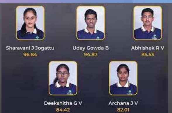
NPUC – Chikkaballapur JEE Main 2024 Achievers.